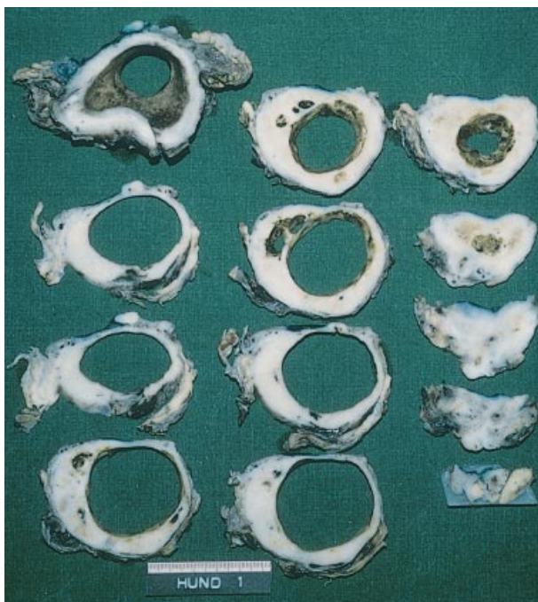
Fig. 1. A dog prostate after laser therapy. Slices cut at 5 mm show definite areas of necrosis.

Of the 12 dogs, four were killed within the first week from treatment, a further four at 4 weeks and the remaining four at 12 weeks. In those dogs killed at 12 weeks, TRUS was performed immediately after death to detect any laser-induced intra-prostatic cavities and the prostates from all the dogs were examined histologically. The extent of the necrotic zones in the prostate was quantified using stereological methods. After the prostates were fixed whole in formalin, they were cut into slices 5 mm thick with a precision slicing machine (Fig. 1). After embedding in paraffin wax, large sections were cut from each slice. The outlines of the prostate slices were drawn under direct vision using a light microscope and the zones of necrosis outlined with a fine pen. Each of the large sections thus marked was projected on to a point grid, and the total number of points counted in the necrotic zones, divided by the total number of points in the prostate, provided an undistorted estimate of the proportion by volume of necrotic tissue in the prostate.